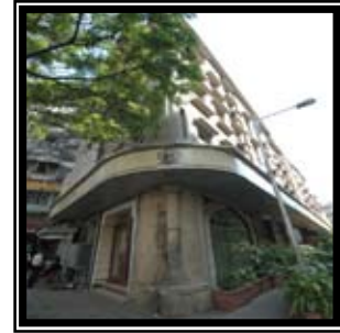
D.N. Road View

For the businessman, a shout away are the Bombay Stock Exchange, High Court and government offices of Mantralaya as well as the business districts of Fort, Fountain, Nariman Point and Crawford Market.